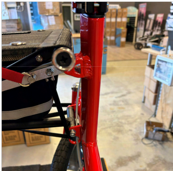
1 Place of assembly of the bottle holder (R or L).