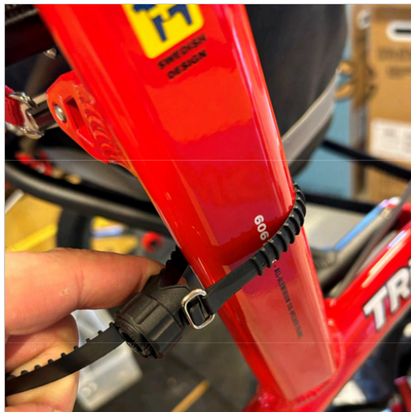
2 Wrap the strap around the frame tube and pull it through the holder.