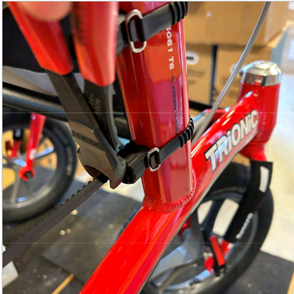
5 Mount the second holder in the same way.