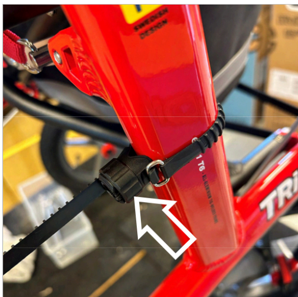
3 Pull the strap tight and turn the nut clockwise to tighten the strap.