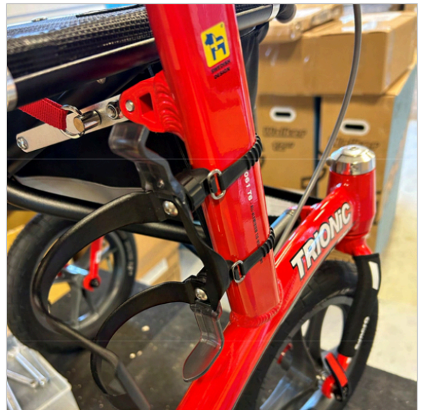
8 The bottle holder is now attached to the frame and you enter the bottle from the side and remove it outwards.