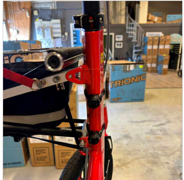
6 The two holders correctly assembled on the frame tube.