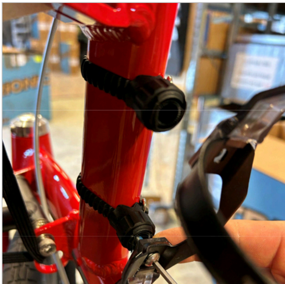
7 Attach the bottle holder with the two screws. The "opening" of the bottle holder should face outwards.